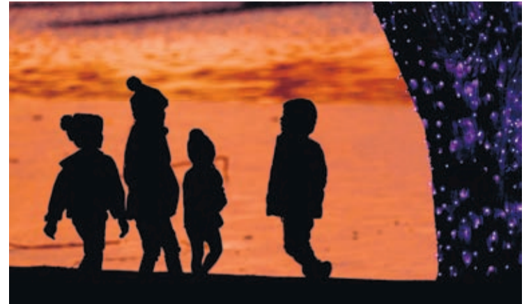
In this Dec. 26, 2020 file photo, children are silhouetted against a pond as they look at Christmas lights at a park in Lenexa, Kan.

A custodial brokerage account is an investing account opened by a parent or guardian for a minor until they reach the age of majority.